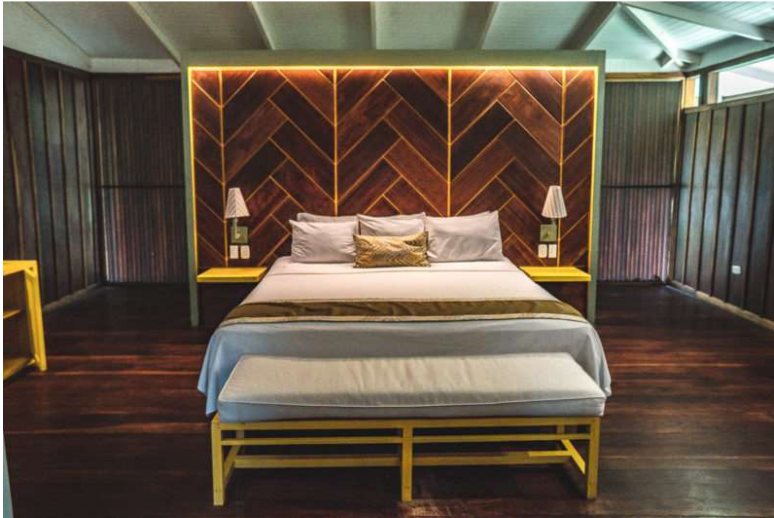
& Canal Tour