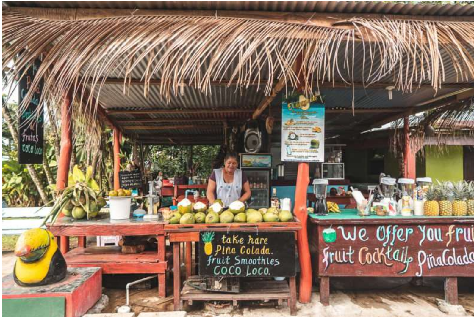
Where to stay in