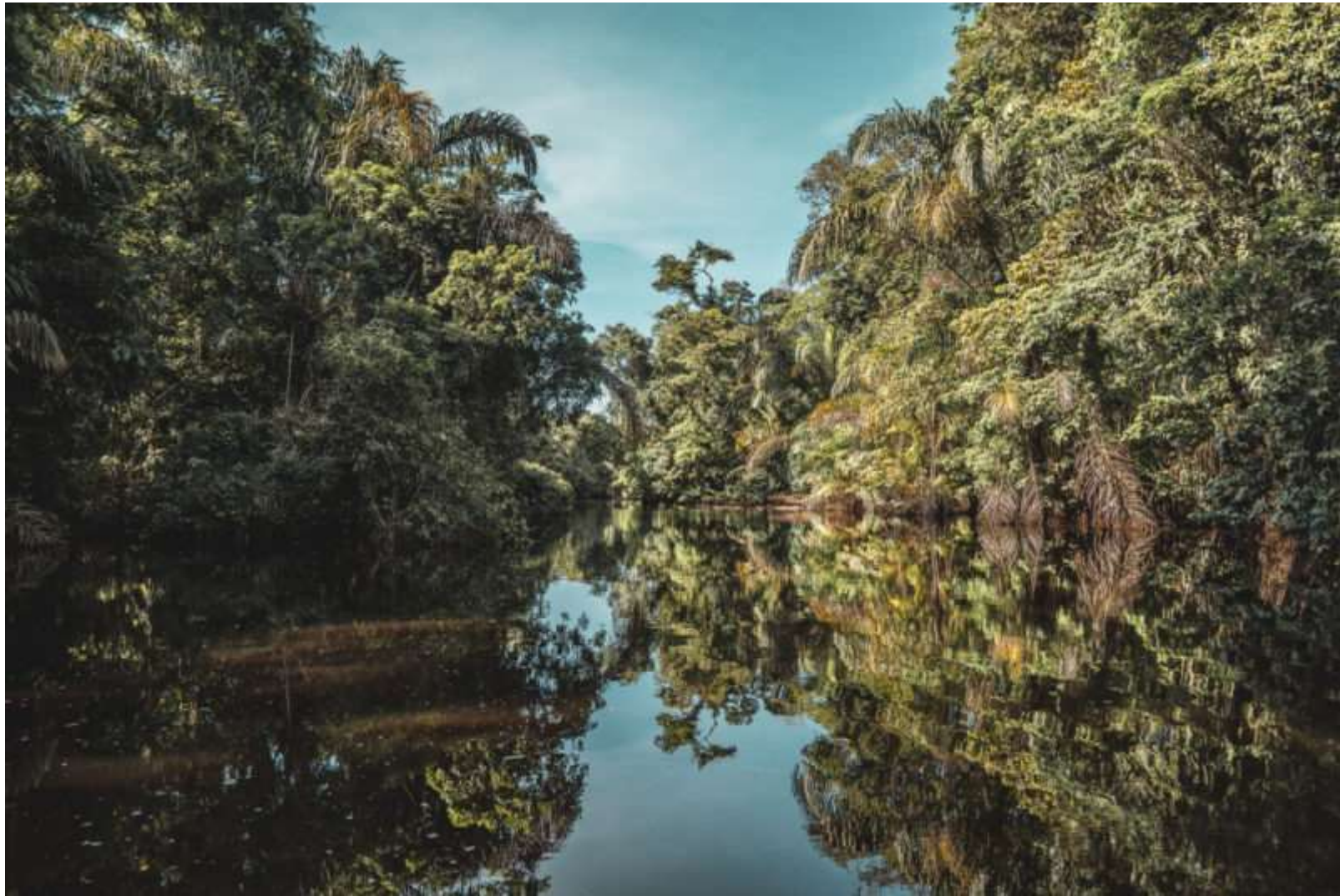
Rafting in Sarapiquí