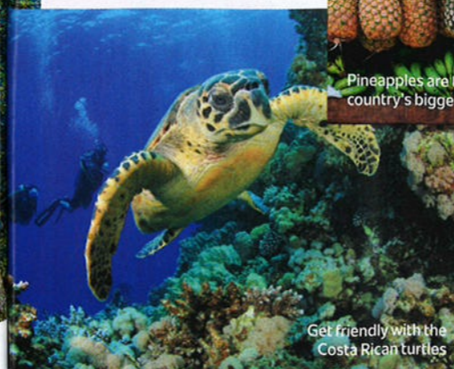
Get friendly with the Costa Rican turtles