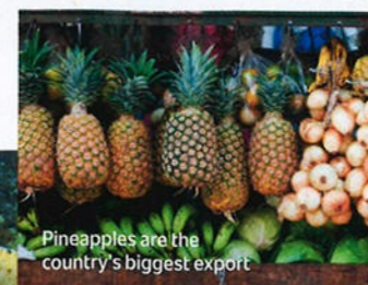
Pineapples are the country's biggest export

What is so apparent in Costa Rica is how content everyone is. I return healthier, more relaxed and happier.